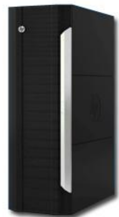
Figure 2: The HP Intelligent Series Rack has industry-leading airflow efficiency.

When you connect these components as shown in Figure 3, the iPDU automatically detects and communicates with each server's iLO Management Engine before the servers are powered on. The