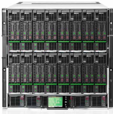
Figure 2. HP ProLiant Server portfolio

Whether it's a departmental server, an enterprise data center, or anything in between, HP can meet your exact needs. You can choose the right levels of performance, availability, expandability, and manageability.